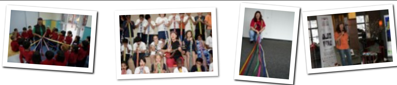
Pictures from left: Class session Yew Chung IS Qingdao, China; Storytelling Based Arts Residency Ulsan, South Korea; Workshop European Council of International Schools Conference 2008 Nice, France; Storytelling at Shanghai Literary Festival China, 2010.