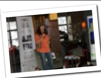
Pictures from left: Class session Yew Chung IS Qingdao, China; Storytelling Based Arts Residency Ulsan, South Korea; Workshop European Council of International Schools Conference 2008 Nice, France; Storytelling at Shanghai Literary Festival China, 2010