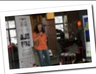
Pictures from left: Class performance at Yew Chung IS Qingdao, China; Storytelling Based Arts Residency in Ulsan, South Korea; Storytelling Workshop at the European Council of International Schools Conference 2008 Nice, France; Performance at the Shanghai Literary Festival China, 2010